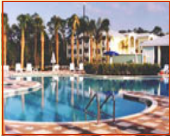
Celebration World Resort, Kissimmee, Florida