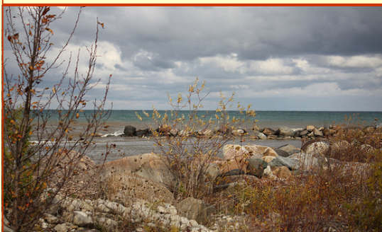
Georgian Manor & Country Club Great Family Resort, all year round!